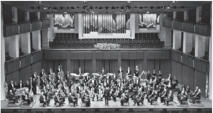
The National Symphony Orchestra and Music Director Christoph Eschenbach.

The Orchestra itself numbers 96 musicians who perform approximately 150 concerts each year. These include classical subscription series, pops concerts, summer performances at Wolf Trap and on the lawn of the U.S. Capitol, chamber music performances in the Terrace Theater and on the Millennium Stage, and an extensive educational program, with performances designed for ages three years and up, and audience engagement activities, as well. Additionally, the NSO's community engagement projects are nationally recognized, including NSO In Your Neighborhood which comprises a week of approximately 50 performances in schools, churches, community centers, and other neighborhood venues) and NSO Sound Health, which has taken the NSO to the National Institutes of Health (NIH), Children's Inn at NIH, Walter Reed National Military Medical Center, Children's National Medical Center, and Inova Health System. Career development opportunities include the NSO Youth Fellowship Program and its Summer Music Institute.